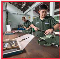
Engineering and vocational institutes