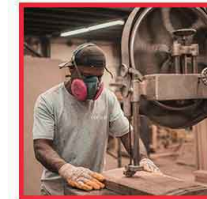
Manufacturing & processing

Our team collectively bring decades of engineering knowledge, financial acumen and sales expertise, acquired through serving customers in various industrial sectors.